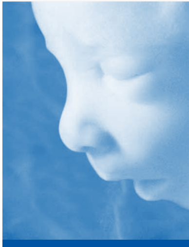
unborn child at 4 months